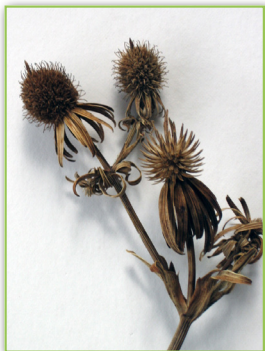
Eryngium seeds (mericarps) encased in a schizocarp

This may seem like a silly question, but different species of wildflowers form seeds along flower stalks, in the central head of the flower, or in specialized seed storage structures on the plant. It's fun to look at seed structures produced by plants and try to figure out why they have adapted into follicles, pods, achenes or nutlets to ensure their success in nature.