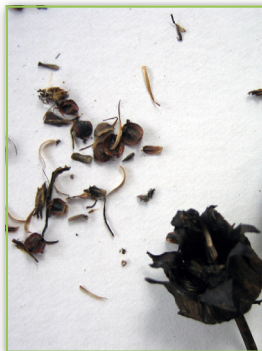
Coreopsis lanceolata seeds (achenes) and seedhead