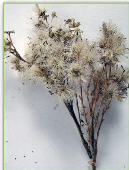
Vernonia seeds (achenes)