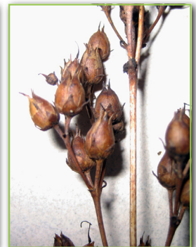
Penstemon seed capsules